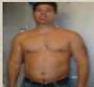
Before Pizza Diet